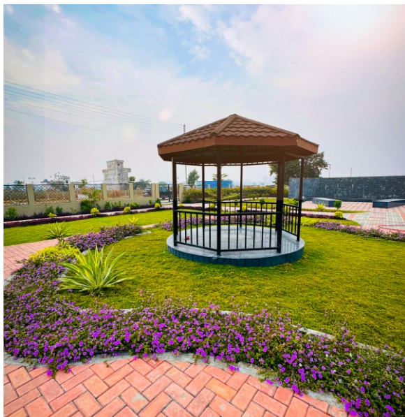
*Actual Images of Silver Icon*